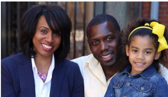
Ayanna Pressley with family