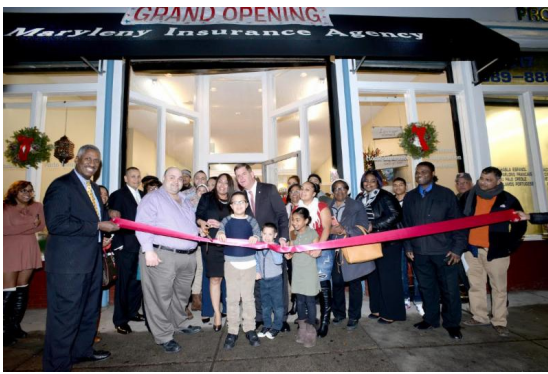
GGHMS welcomes Maryleny Insurance to Grove Hall and made the news for it, read the story here .