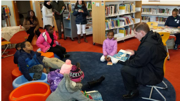
Mayor Walsh reading a story to children attending the annual tree lighting in Grove Hall.