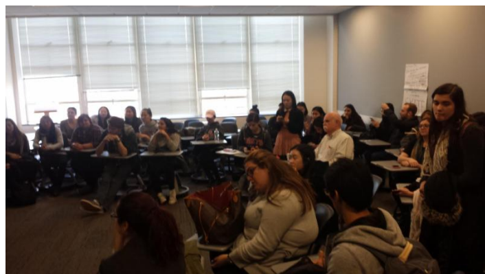
GGHMS worked with teams from the Boston University Ad and PR club.