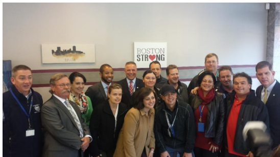
City officials from Inspectional Services launching the Mayor's new restaurant grading program.