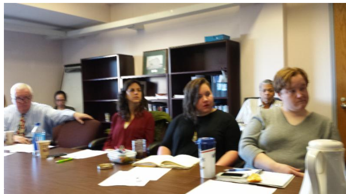
GGHMS Directors at Last Director's meeting with the City of Boston Main Street Department and invited City officials.