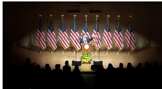
Mayor Walsh giving his State of the City Address.