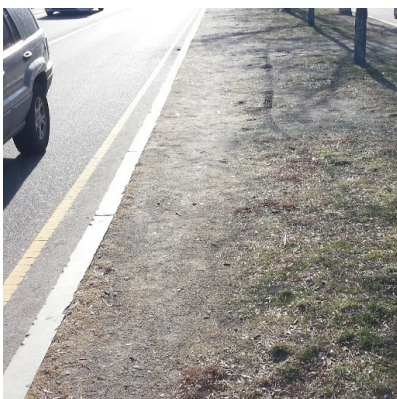
GGHMS has applied for a $5,000 grant to beautify the "grassy" median in Grove Hall.