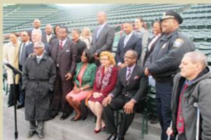
HBC Legacy Weekend press conference