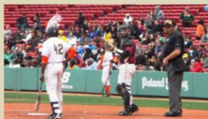
FAMU vs NC Central U at Fenway Park