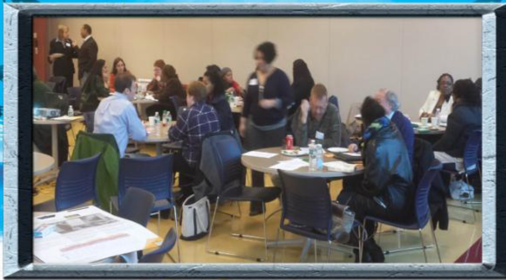
Photo of Fairmont Corridor meeting