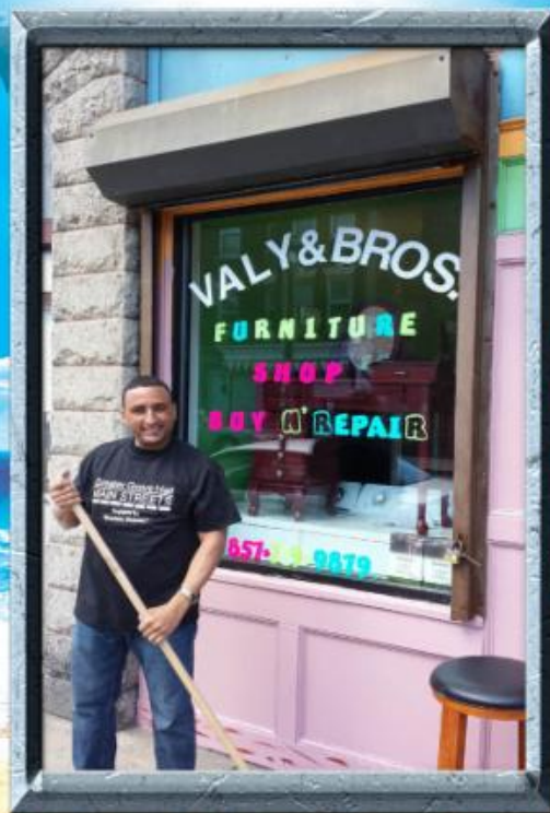
One of the newer members of the Greater Grove Hall Community participating in Boston Shines. He's wearing a Greater Grove Hall Main Streets t-shirt.