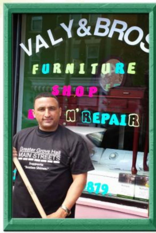
One of the newer members of the Greater Grove Hall Community participating in Boston Shines. He's wearing a Greater Grove Hall Main Streets t-shirt.