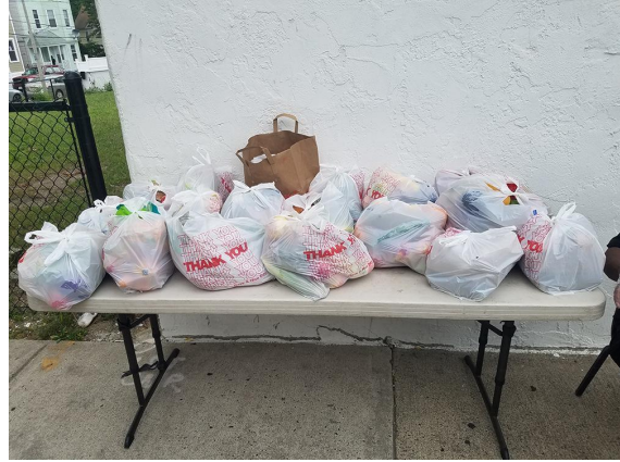
Walthall Chapel COGIC, helps local families during this difficult time.

There are a range of resources for those in the Grove Hall community.