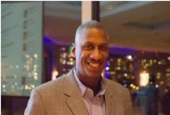
Greater Grove Hall Main Streets Executive Director on BNN.