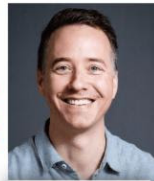
ZACHARY SMART PACKET, AN EQUINIX COMPANY