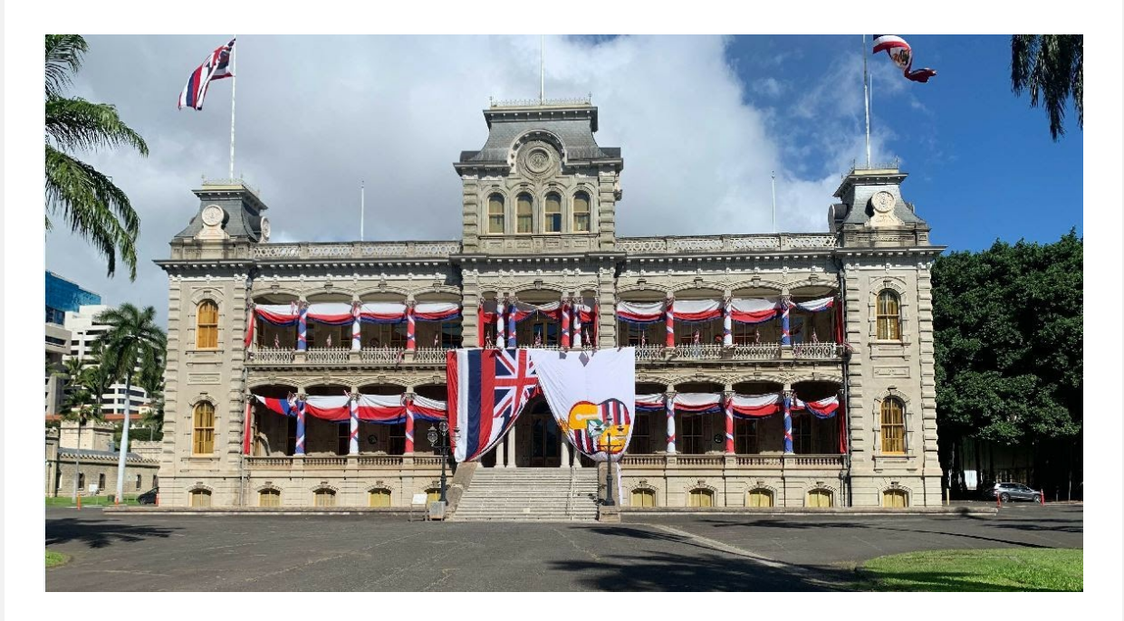
Iolani Palace in Honolulu, Hawaii.

The National Park Service is now accepting applications for the <u>Save America's</u> <u>Treasures</u> (SAT) grant program. The SAT program provides preservation and conservation assistance to nationally significant historic sites and collections. $26.5 million will be competitively awarded. A dollar-for-dollar, non-Federal match, is required, this can be either cash or documented in-kind services. SAT is administered by the National Park Service (NPS) in partnership with the <u>National</u> <u>Endowment for the Arts</u> (NEA), the <u>National Endowment for the Humanities</u> (NEH), and the <u>Institute of Museum and Library Services</u> (IMLS). Preservation projects fund physical preservation of historic buildings, sites, structures, and objects. Collection projects include conservation of artifacts, museum collections, documents, sculptures, and works of art.