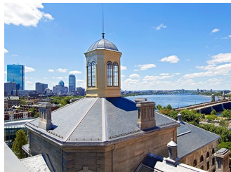
Boston Staycation: Overnight Stay for Two with Breakfast at The Liberty, a Luxury Collection Hotel