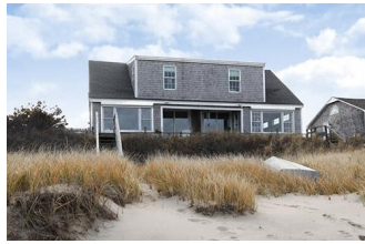
Sandwich, MA Cottage Getaway for four May 5 - May 7