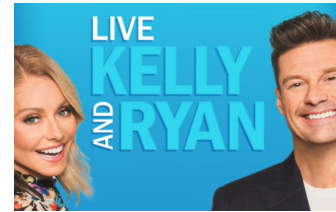
YOU and three friends will be members of the "LIVE" Kelly & Ryan Show studio audience

We also will be auctioning beautiful Jewelry, Artwork, Sports Memorabilia and lots, lots more!