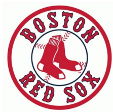
Four Seats for a 2023 Mutually Agreed Upon Regular Season Red Sox game