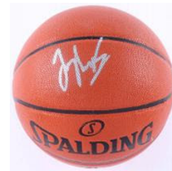
Celtics' Jaylen Brown signed basketball