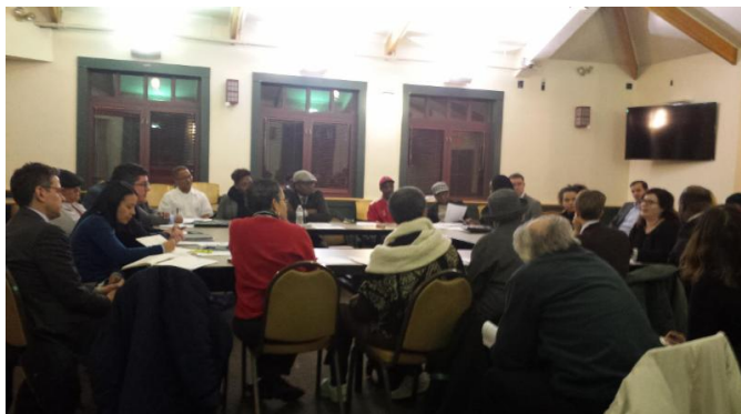
Imagine Boston 2030 meeting at Franklin Park Club House. A meeting for the wider community took place the following week.