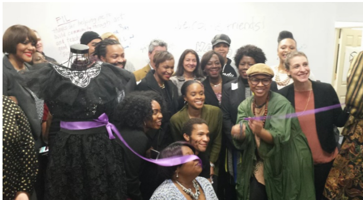
Ribbon Cutting with Fairmont Innovation Lab.