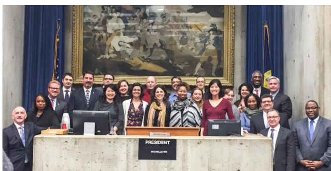
Main Streets Executive Directors after a meeting with Boston City Councillors.