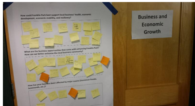
These are the types of questions we would like to hear. You can contribute your ideas by submitting them to the Imagine Boston 2030 website.