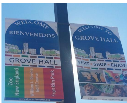
Part of Citizen's Bank grant was used to purchase the banners shown above, as well as light poles.