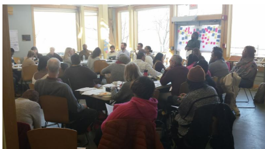
Members of the Fairmont Indigo Network met for an all day retreat to work on the development of a strategic plan for the businesses and residents of the Fairmount Corridor.