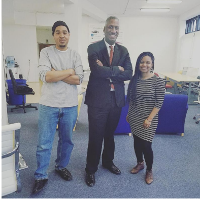
A photo from the Fairmont Innovation Lab Pitch event.