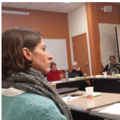
Fairmount Indigo meeting