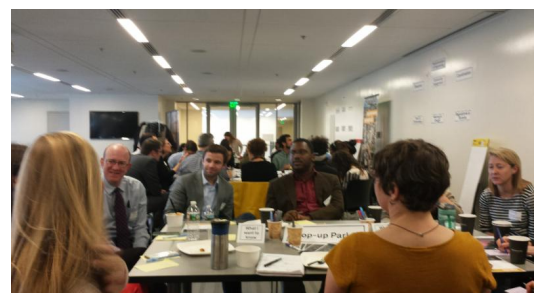
Routes to Placemaking Workshop: Hosted by A Better City in partnership with MA Smart Growth Alliance.

This well attended workshop provided an opportunity for participants to learn more about different types of placemaking such as pop-up parks, parklets, pavement murals, and many more. Greater Grove Hall Main Streets will be looking to implement some of these ideas in the upcoming year.